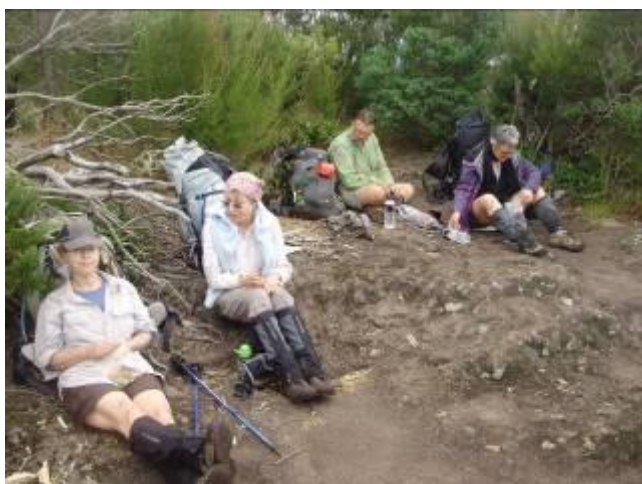
Lunch at Lizard Pt