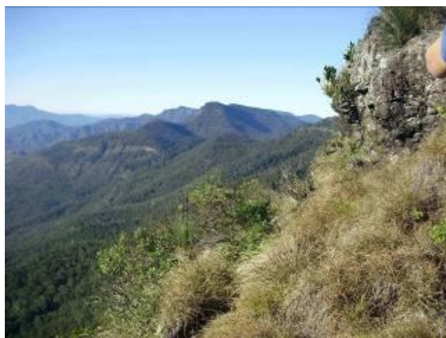
Looking from Spicers to Superbus